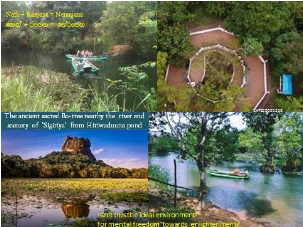
FIGURE-03 [Natural beauty of the genuine location where Buddha obtained enlightenment]

4. The ancient Bho-tree at Hiriwaduuna is also named by the villagers as ' Sudu Bodhiya ' because a white sprout is occasionally spring out from the southern side of the Bo-tree as shown also in the figure-02. The famous Bo-tree in Anuradhapura- ' Jaya Sri Mahabodhiya '- is also a southern sprout from the mother tree at Hiriwadunna as defined by Most Ven. Siri Dhammalankara thero. ( But according to the poem 'Mahavanasa', it was a sprout brought to Lanka from Gaya of India at a later stage. )