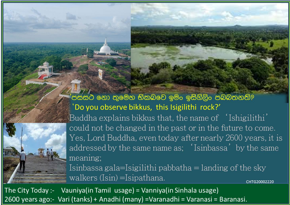
FIGURE-04 [ 'Isipathana' at where Buddha preached 'Damsak Pavathum sutta' ]

Special note-02: Buddha has also referred another four yonder rocks, in the vicinity from 'Isipathana', in the 'Isigilithi sutta' such as;