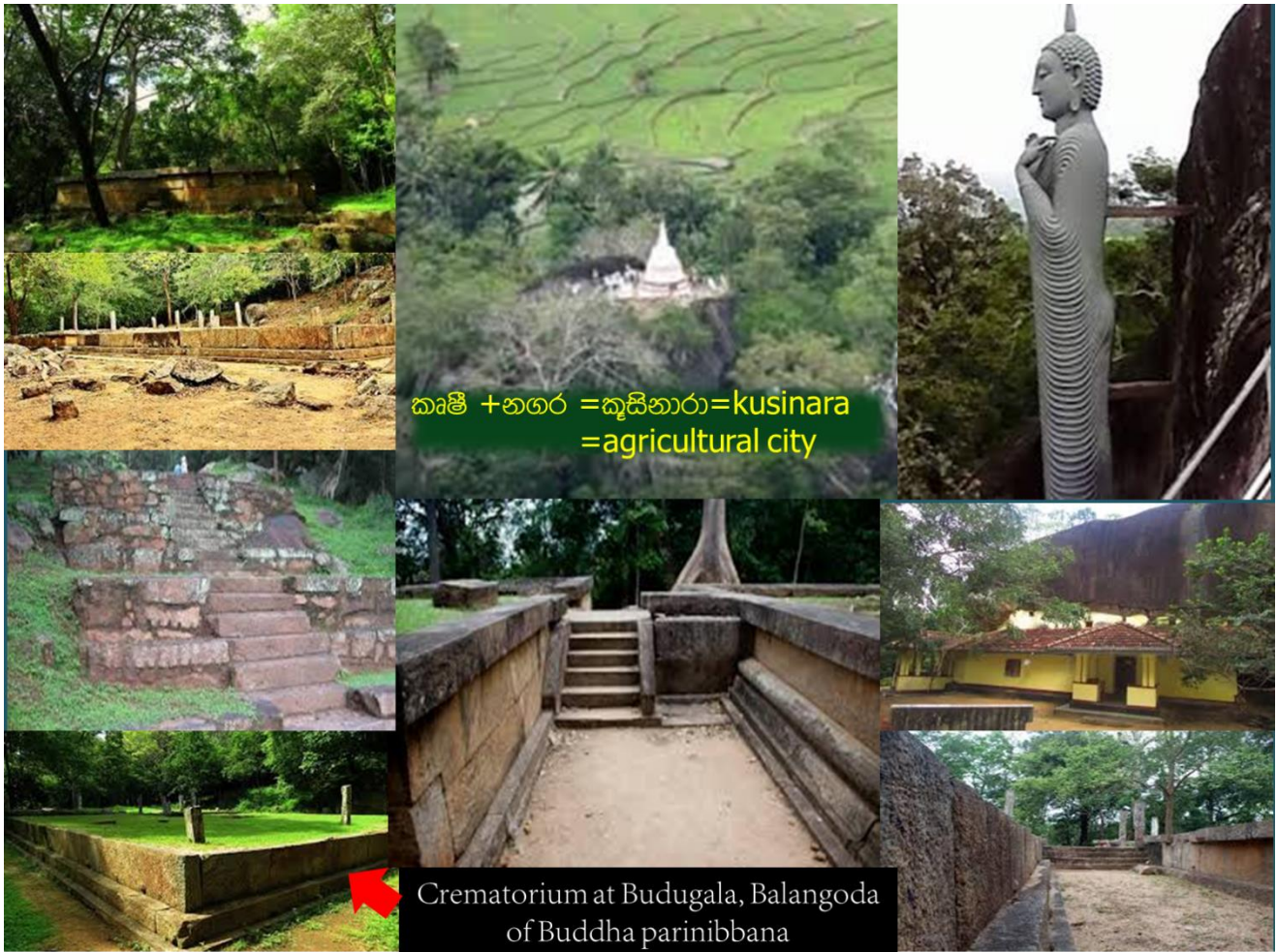
FIGURE-07 [End of the light of Asia at Budugala]