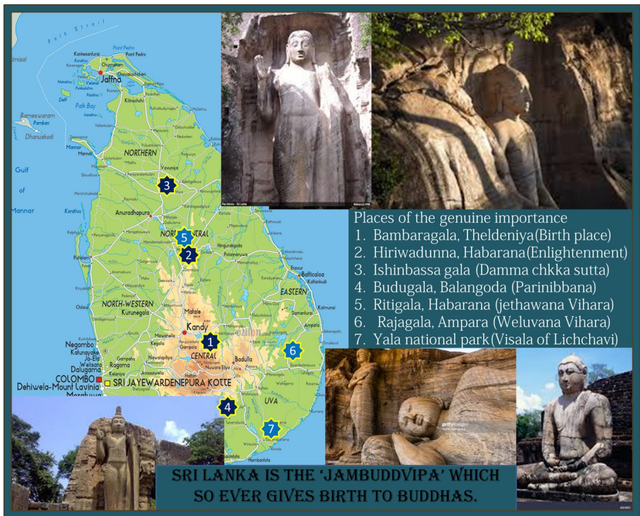
FIGURE-08 [The four blessed locations in a map]