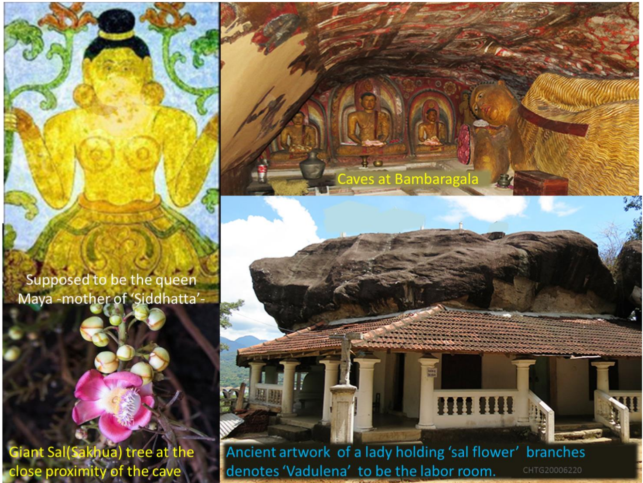
FIGURE-01 (Bambaragala at Theldeniya: the genuine birthplace of 'Siddhatta' ).