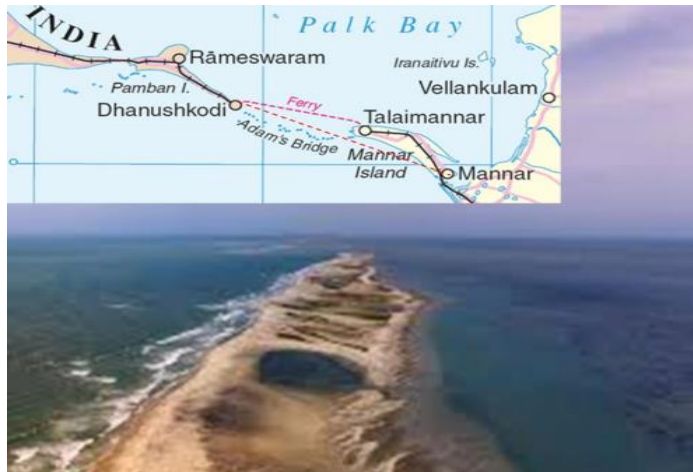
FIGURE-11 [the bridge built by the prince Rama to connect the island]

As the living proof, the temple Rameshwaram of South India stands there at the other end of the currently inundated sea bridge. [ Srirama temple in Kerala is known to have a far historic background more than 5000 years ]