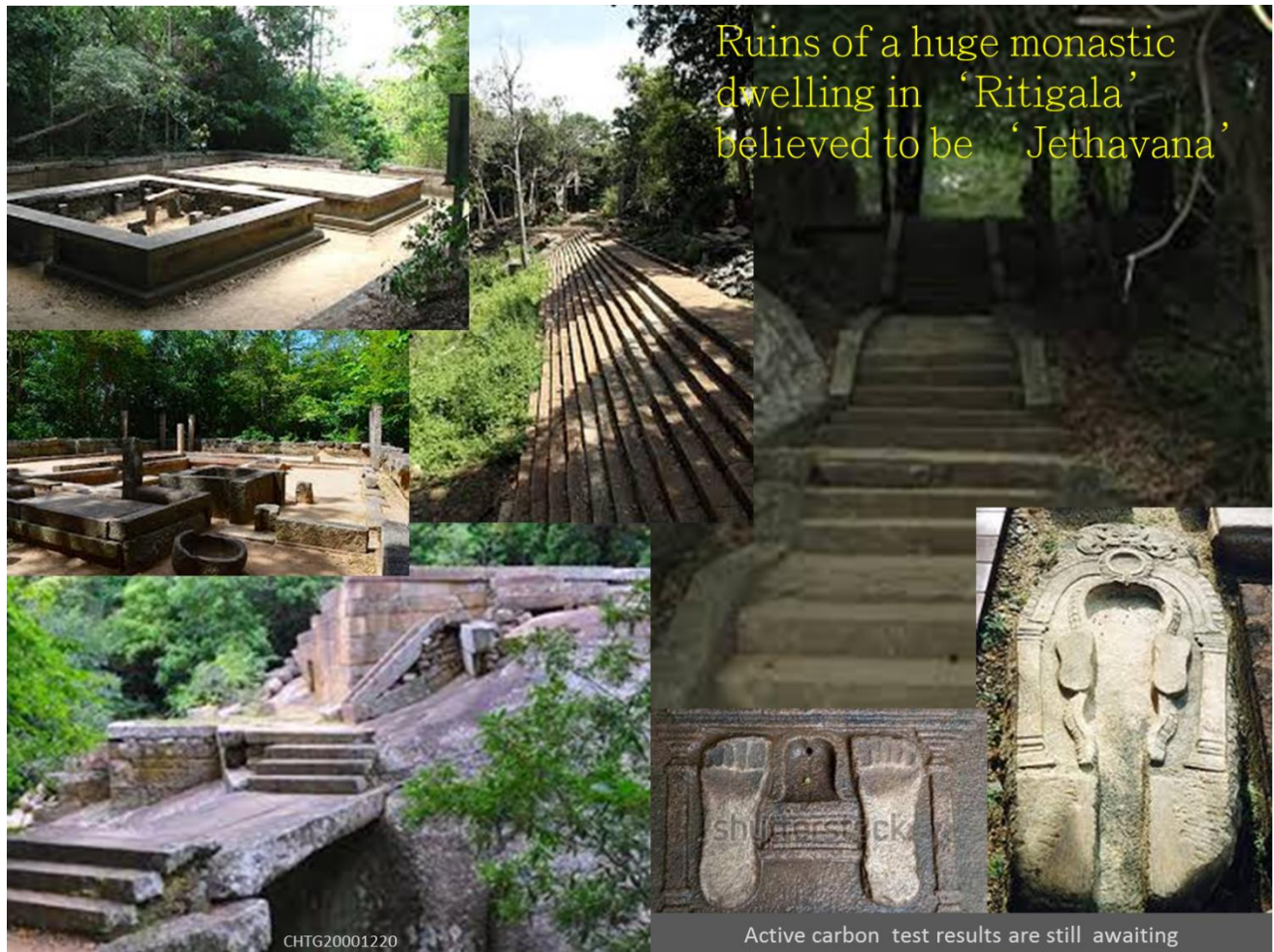
FIGURE-05 [Jethawana Vihara monastic ruins at Ritigala]