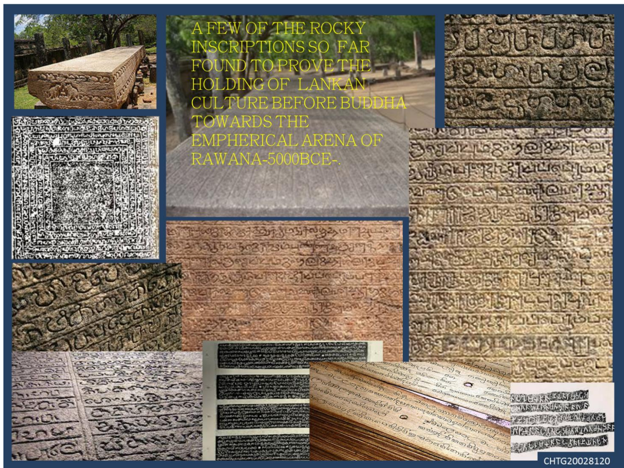
FIGURE-09 [few from the vast stock of inscriptions written in ancient Sinhala =Magadhi]

took their own course of growth and development. But it is not certain when exactly it took place. It was probably such an unidentified period during which modern Indian languages begin to take modern shape. By the end of the 12th century, the development of Apabhramsa reached its climax. Gujarati, Marathi, Bengali, Assamese, Oriya, Maithili and other modern languages took definite shape in their literary writings in the beginning of the 14th century. The distinct shape of Magadhi can be seen in the Dohakosha written by Sarahapa and Kauhapa. Magadhi had a setback due to the transition period of Magadha administration. [13] Traditionally, strolling bards recite long epic poems in this dialect, and it was because of this that the word "Magahi" came to mean "a bard". Kaithi is the script generally used for it. The pronunciation in Magahi is not as broad as in Maithili and there are a number of verbal forms for each person. [14] Historically, Magadhi had no famous written literature.